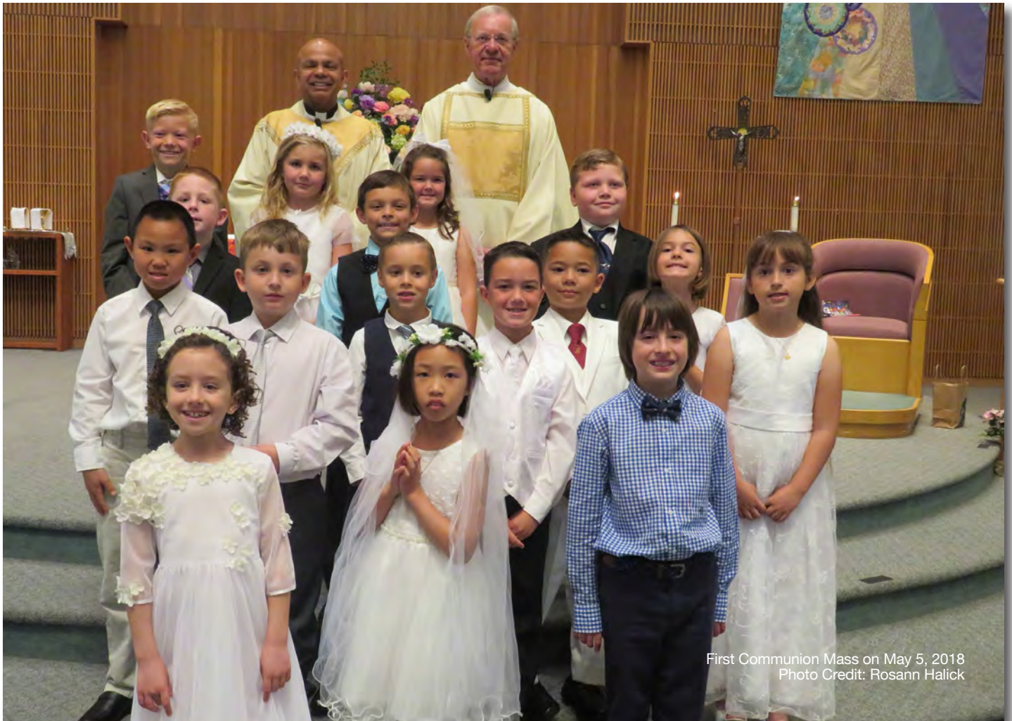
First Communion Mass on May 5, 2018

5562 Clayton Road, Concord, CA 94521 • PHONE (925) 672-5800 • FAX (925) 672-4606 • www.stbonaventure.net