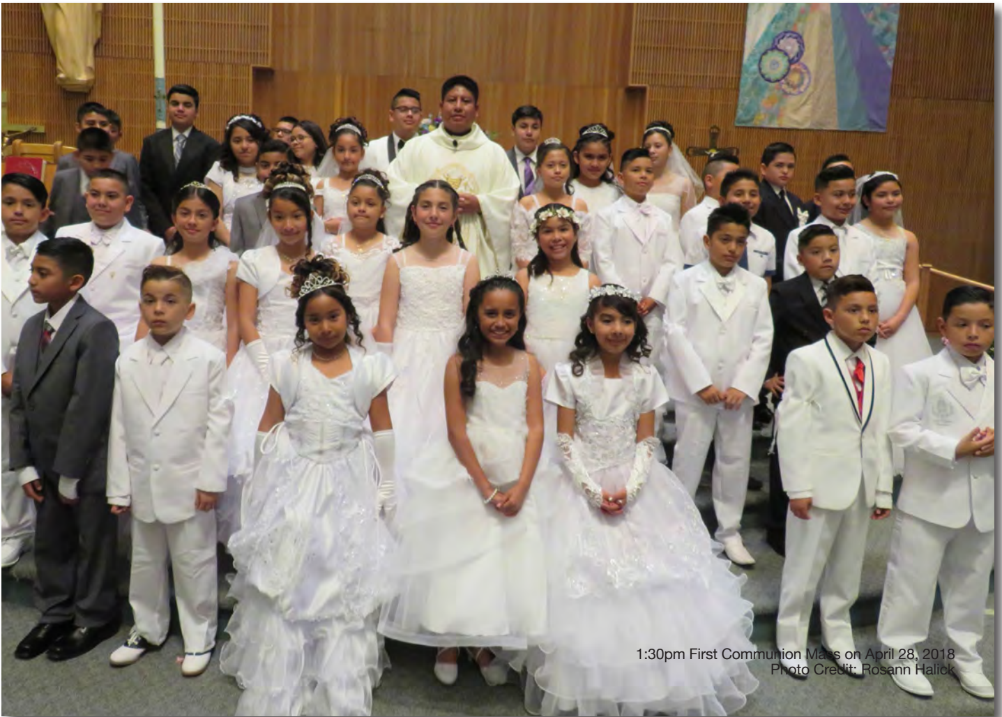
1:30pm First Communion Mass on April 28, 2018

5562 Clayton Road, Concord, CA 94521 • PHONE (925) 672-5800 • FAX (925) 672-4606 • www.stbonaventure.net