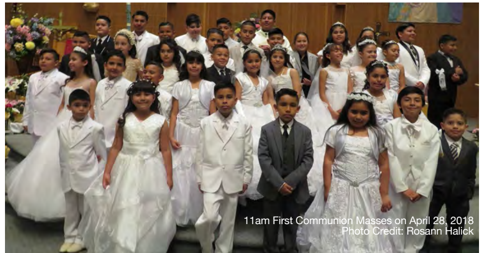
11am First Communion Masses on April 28, 2018

Necesitamos ser personas para los otros. Jesús demostró el amor de Dios, su Padre, por nosotros al vivir para nosotros y morir por nosotros. Por lo tanto, como discípulos de Jesús, debemos ser personas para los demás, sacrificando nuestro tiempo, talentos y vida por los demás.