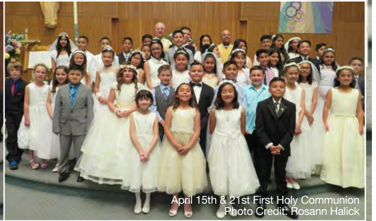
April 15th & 21st First Holy Communion