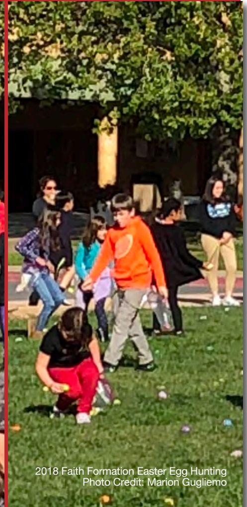
2018 Faith Formation Easter Egg Hunting