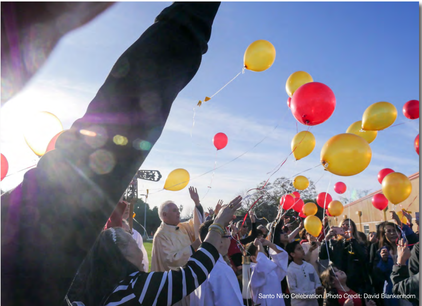
Santo Niño Celebration.

5562 Clayton Road, Concord, CA 94521 • PHONE (925) 672-5800 • FAX (925) 672-4606 • www.stbonaventure.net