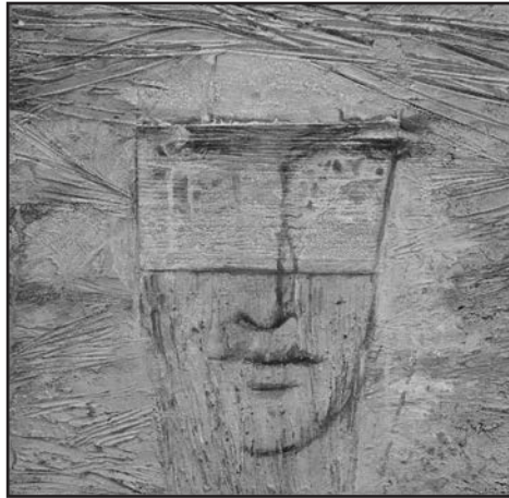
To Be Seen by Ludmila Pawlowska

More than 150 contemporary icons by internationally known Russian artist Ludmila Pawlowska, plus traditional icons