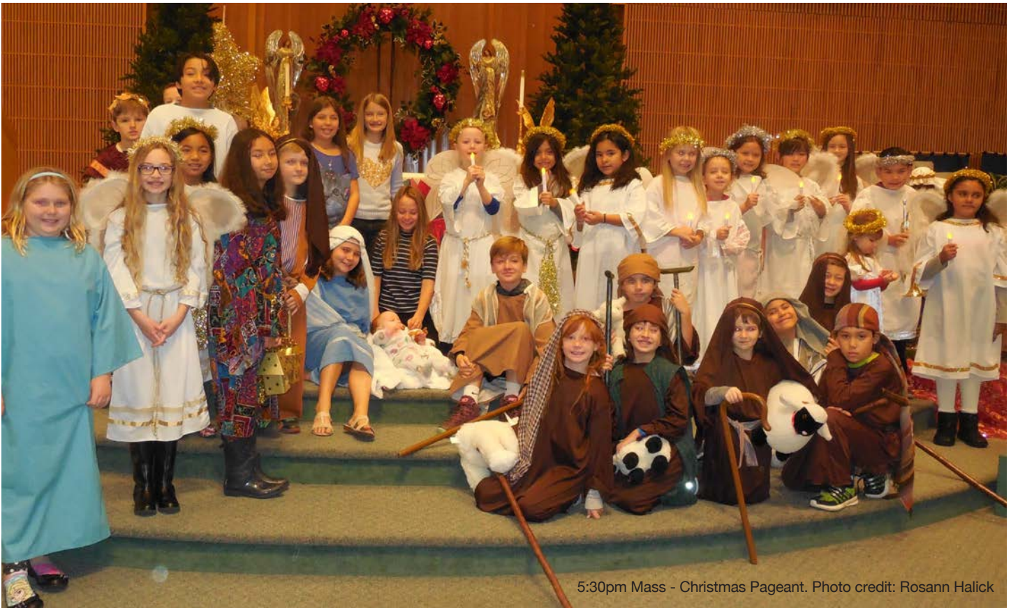
5:30pm Mass - Christmas Pageant.