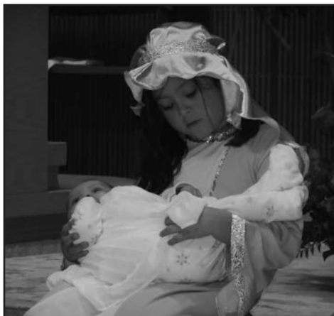
Las Posadas Celebration on December 16.

SANCTUARY LIGHT IS LIT FOR ANCILLA JULIETTA MCKENZIE January 7 – 13, 2017