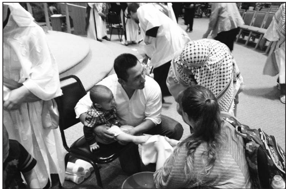
Holy Thursday service.