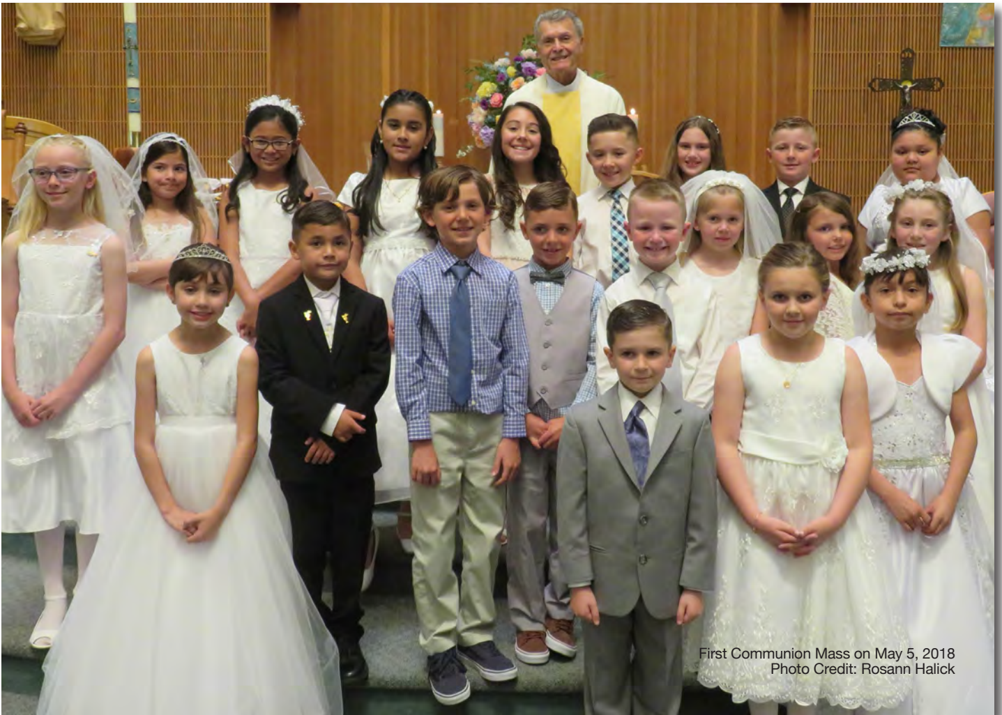
First Communion Mass on May 5, 2018

5562 Clayton Road, Concord, CA 94521 • PHONE (925) 672-5800 • FAX (925) 672-4606 • www.stbonaventure.net