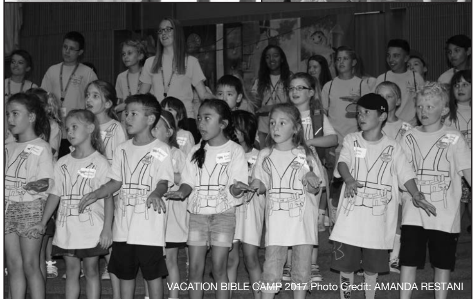
VACATION BIBLE CAMP 2017.