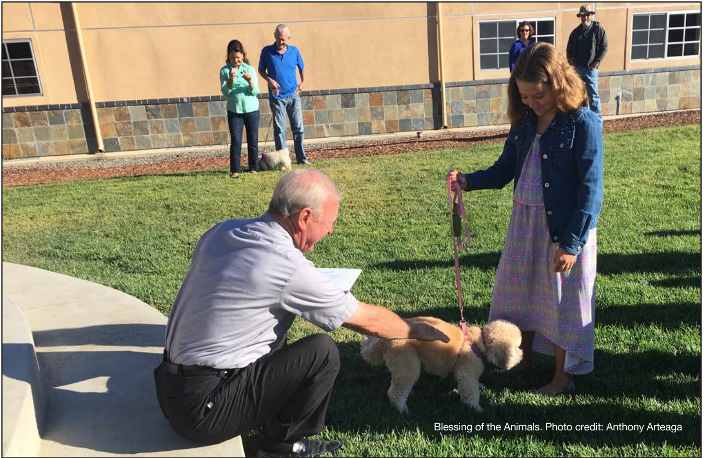
Blessing of the Animals.