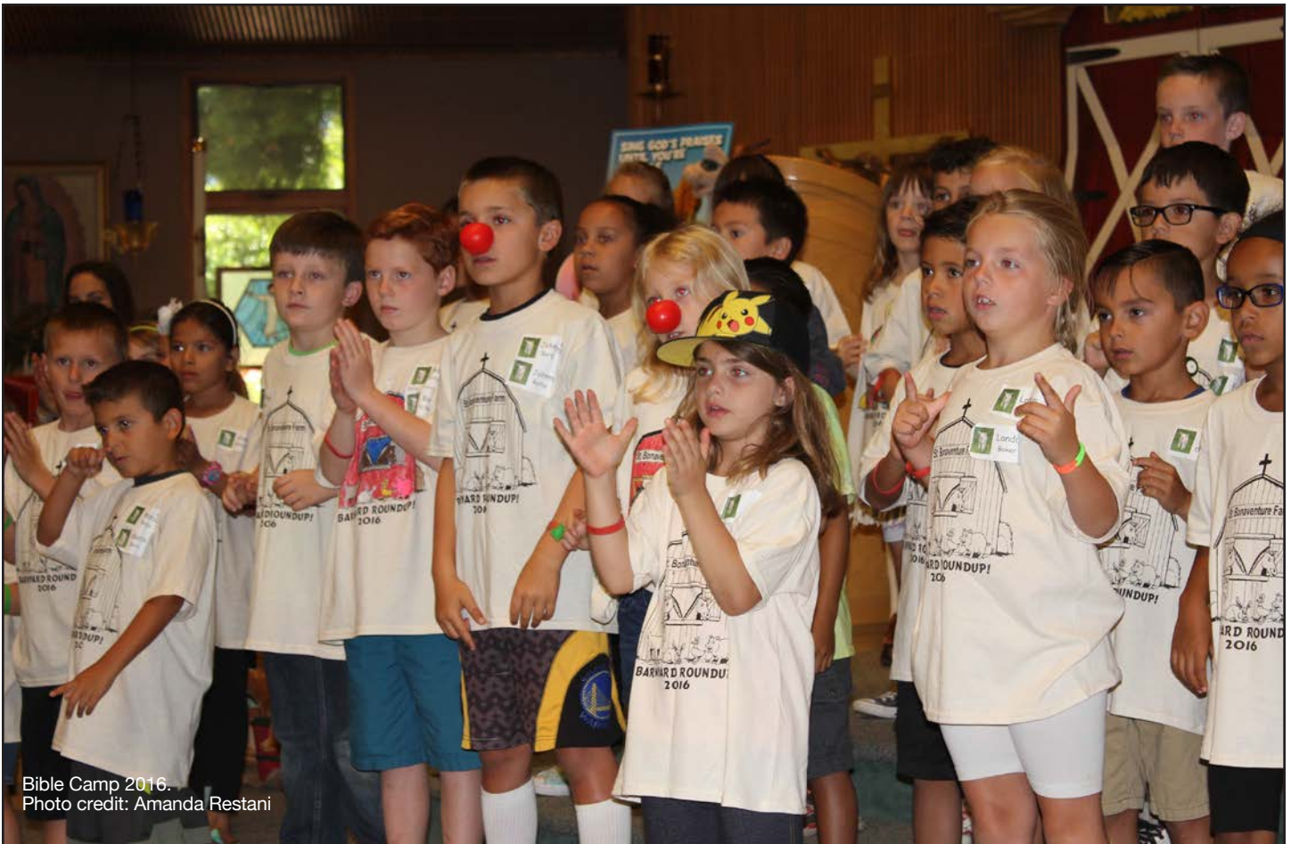
Bible Camp 2016.