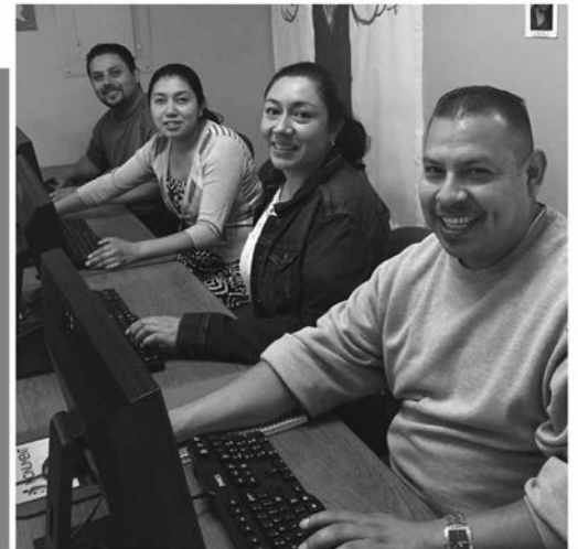
Clase Horario Fechas

Aprende en tu idioma, en un ambiente familiar y tranquilo, con instructores capacitados, pacientes; siempre listos para apoyarte y motivarte a lograr tus metas.