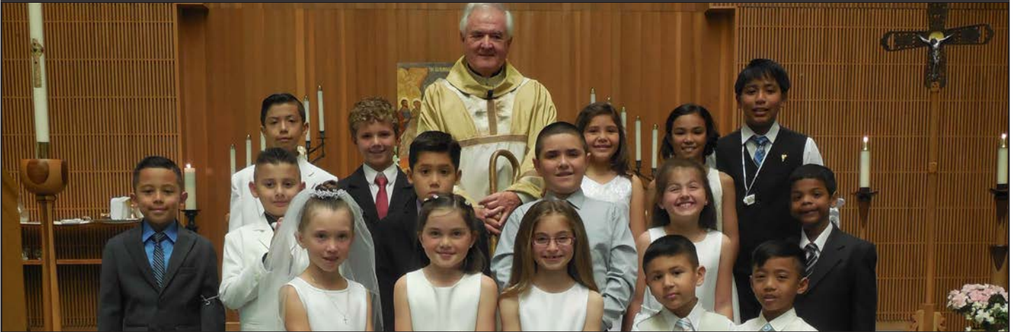
First Communion from April 23, 2016 9:30 am Mass (top) and 12 Noon Mass (below).