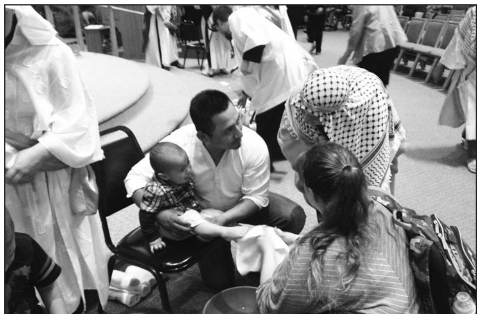
Holy Thursday service.