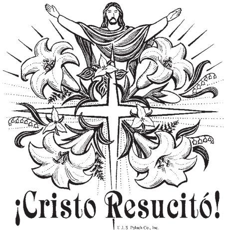
F. J. S. Paluch Co., Inc.

Este pendiente de nuestro boletín para más información.