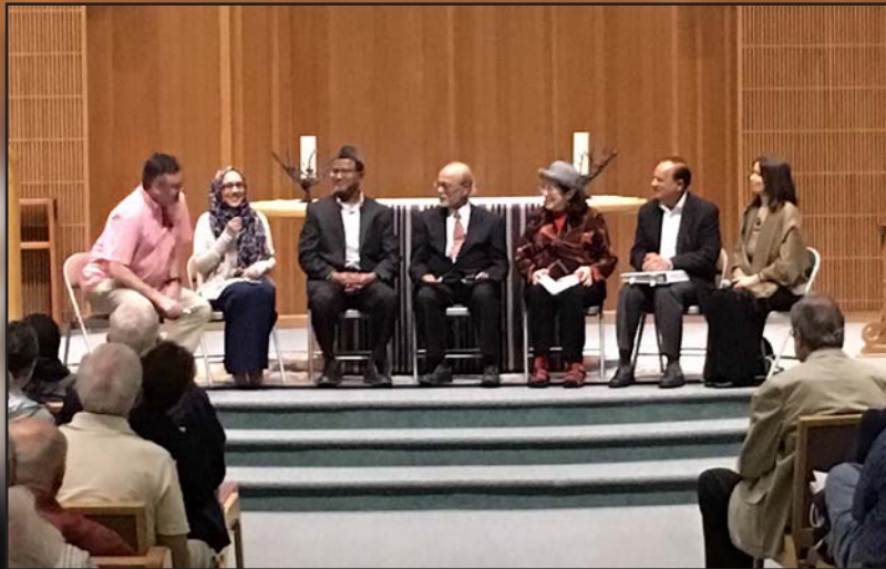
Islam Panelist Discussion.