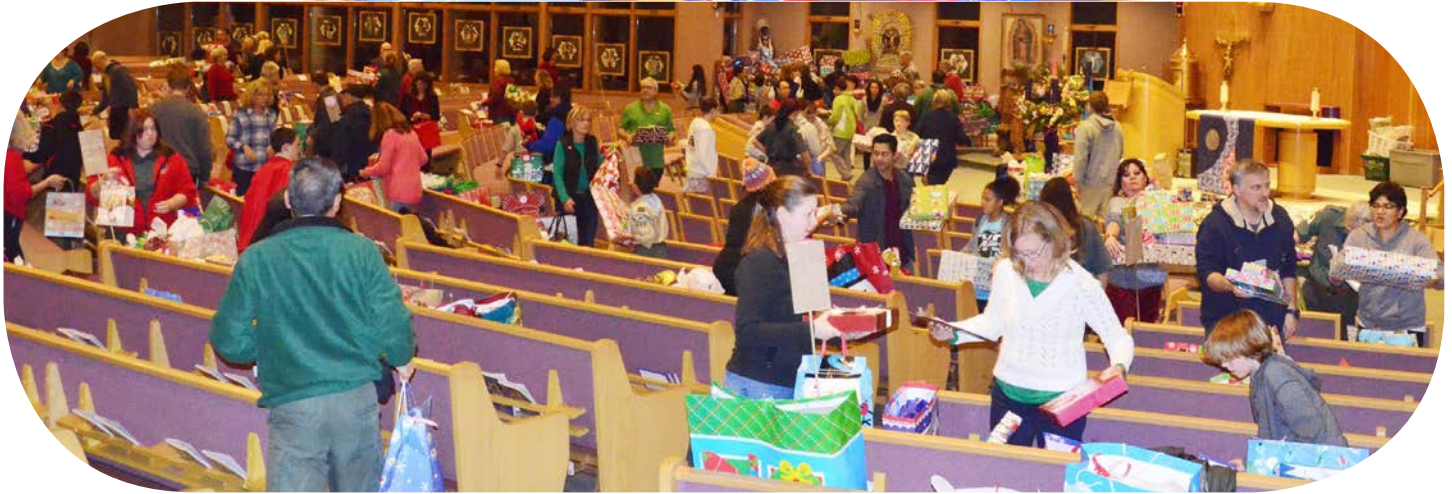
Giving Tree 2015.